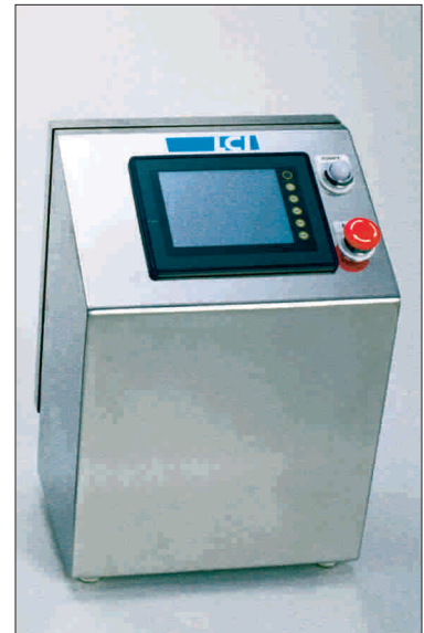
The LCI Multi Granulator is supplied with a touch screen control panel.