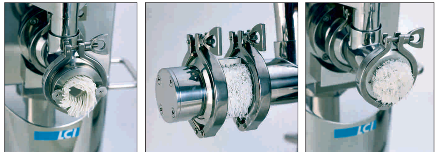
Three types of extrusion—axial, radial, and dome—can be evaluated by simply changing the extrusion head.