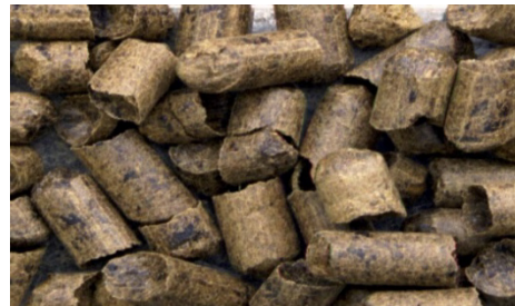
Coffee chaff after pelleting

In the new system, a prebin with high and low level probes is used to temporarily store the hot chaff. The chaff is discharged from the prebin using a specially designed bin agitator that moves the material into a mixer/feeder where water is introduced. The addition of water (1) extinguishes chaff from the roasters that could still be smoldering, (2) cools the chaff, and (3) provides lubrication for the pelleting