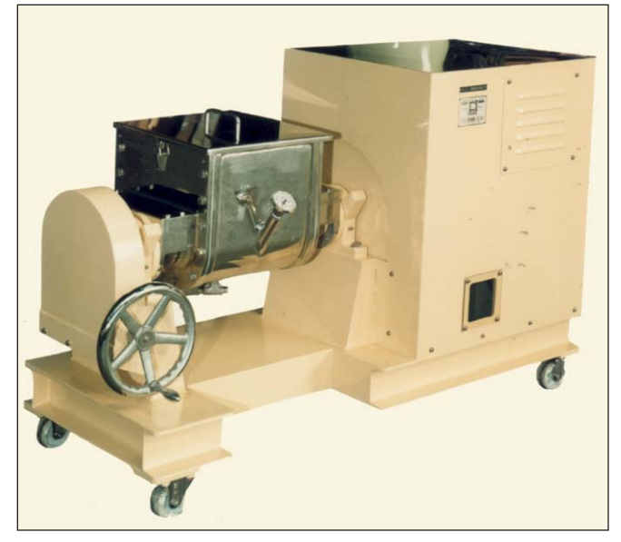
Above: Batch Kneader

Dry ingredients are manually charged into the bowl. Liquid is added to the moving dry powder and mixed by the counter rotating twin shafts, producing a uniform wet mass. Once the desired mixture characteristics are achieved, the kneader bowl is tilted using the hand wheel (or via motor) and the product is discharged and collected for further processing.