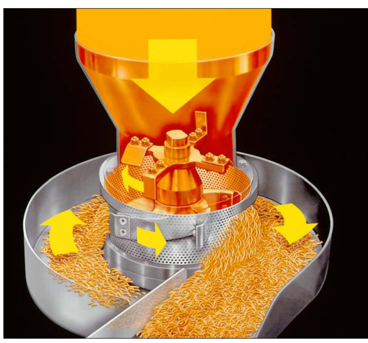
LCI Corporation is the exclusive distributor for Fuji Paudal Company, Ltd. in the Americas.