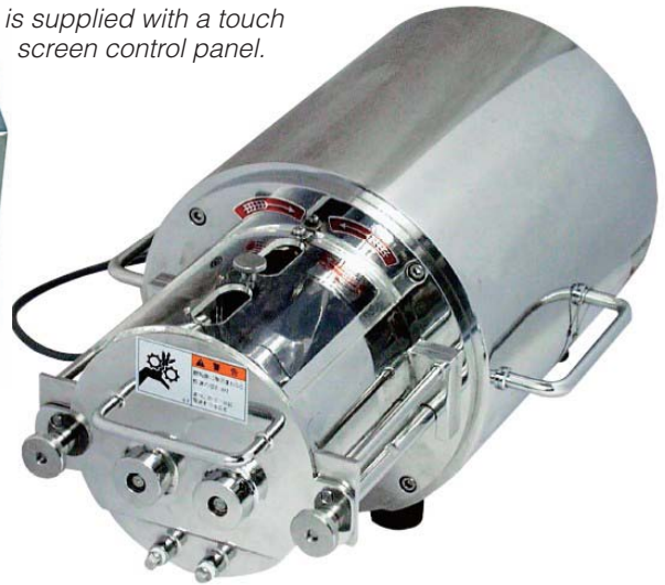
Below: In the LCI Batch Kneader, liquid and powder are thoroughly mixed by the counter rotating twin shafts.