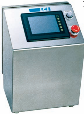
The LCI Batch Kneader is supplied with a touch screen control panel.

LCI Corporation is the exclusive distributor for Fuji Paudal Company, Ltd. in the Americas.