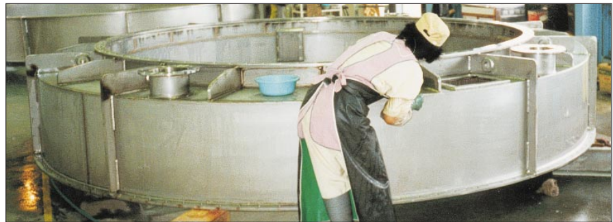
The customer specified a one-piece design to minimize installation time.

LCI's Circle Feeder was tested and found to solve the processing problems. The Circle Feeder's design allows for a large inlet that exceeds the critical arching diameter for most materials. The large open throat that was the same diameter as the silo allowed for a straight-walled design which eliminated the typical cone and greatly reduced overall headroom. Pilot scale testing indicated that slow rotation speeds with an enlarged exhaust port allowed for very high discharge efficiency. An additional benefit was found in that the rate could be varied reliably over a 10:1 range. Since the paper was very light, "self revolution" stoppers were included in the straight-walled hoppers to prevent the material from turning and to allow mass flow.